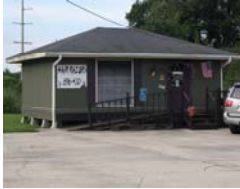
101 Kentwood Carencro

HAIR SALON FOR SALE FULLY EQUIPPED PRICE REDUCED!